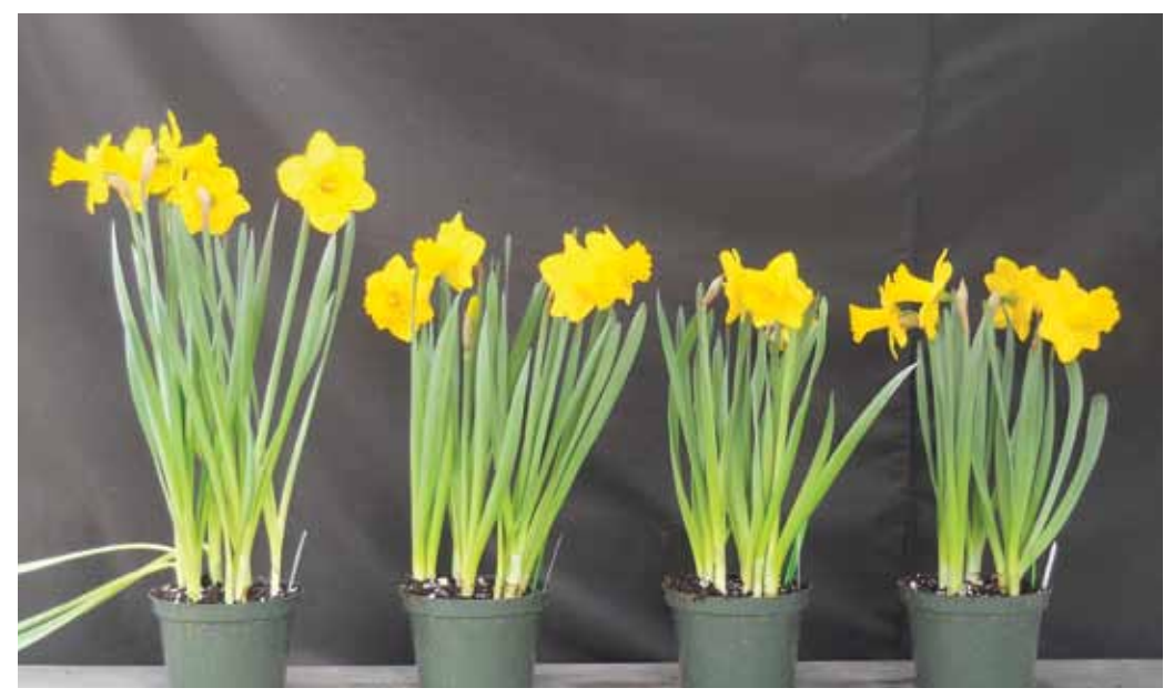
Figure 4. The effects of a Florel drench on 'Primeur' daffodils at full flower. Seventeen cold weeks in the greenhouse on Jan. 31. Left to right: Control (no Florel) or 250 ppm applied (4 ounces per 6-inch pot) one, six or nine days after transferring plants into the greenhouse.