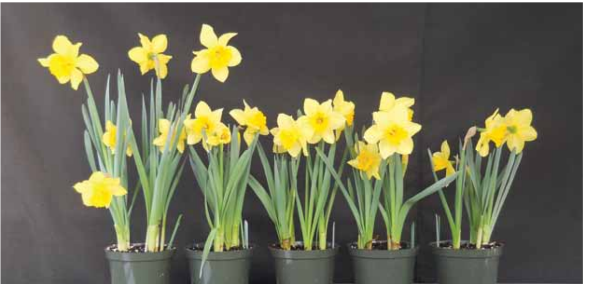
Figure 2. The effects of a Florel drench on 'Carlton' daffodils at full flower. Eighteen cold weeks in the greenhouse of March 6. Left to right: Control, 100-, 200-, 300-, or 500-ppm Florel drench (4 ounces per 6-inch pot) applied at the 2- to 4-inch leaf stage.

Ethylene is released from the substrate over many days, and the speed of release varies within the pH range of soil-less mixes (5.4 to 6.2). Florel substrate drenches can perhaps be thought of as a "slow release" ethylene treatment system. Substrates at a low pH have a longer but slower release