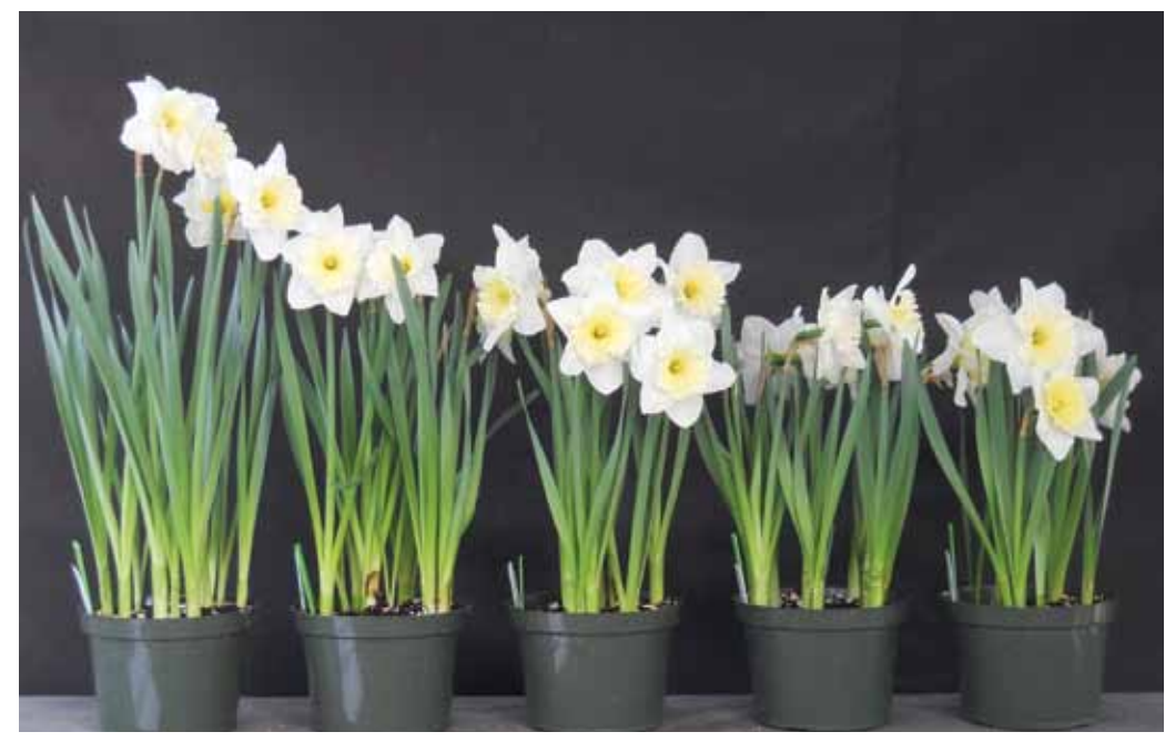
Figure 3. The effects of a Florel drench on 'Ice Follies' daffodils at full flower. Eighteen cold weeks, in the greenhouse on March 6. Left to right: Control, 100-, 200-, 300-, or 500-ppm Florel drench (4 ounces per 6-inch pot) applied at the 2- to 4-inch leaf stage.