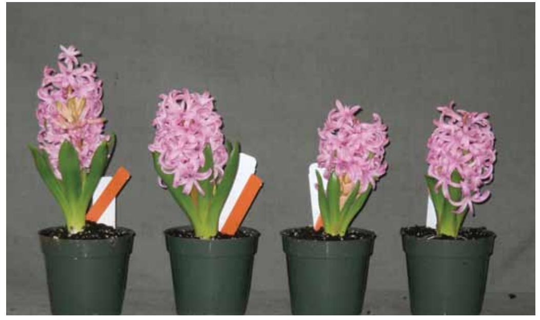
Figure 5. The effects of a Florel drench on 'Pink Pearl' hyacinths at full flower. Seventeen cold weeks in the greenhouse on March 8. Left to right: Control, 200-, 350-, or 500-ppm Florel (2 ounces per 4-inch pot) applied three to four days before the first flower opened.

of application was the same as for a normal Florel spray: when daffodil leaves were about 3 to 4 inches tall, and for hyacinths three to four days before the lowest flower opened. Results are summarized below.